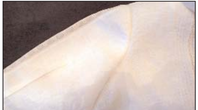
Garment photographed: “A-Line Christening Gowns II”