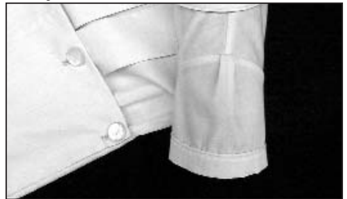
Garment photographed: “Boy’s Button-on Suit”

If you have trouble setting in a straight sleeve, you may make a 1/2” box pleat in the sleeve at the shoulder seam. This allows fullness for comfort, makes the sleeve easier to set in, and makes a neat appearance in the finished garment.